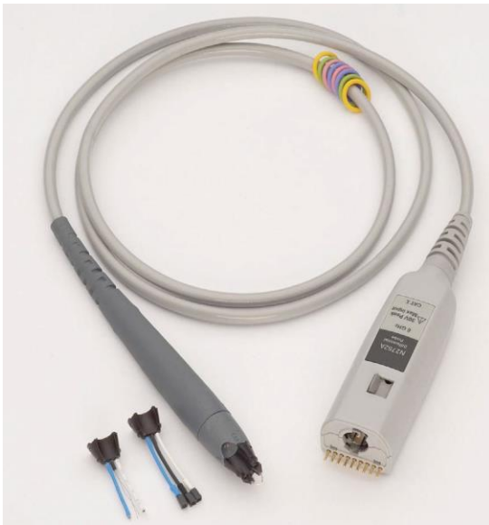
Keysight's InfiniiMode N2750A Series differential active probe.

During the design and debug phase of product development, engineers often need to test “live traffic” in their hi-speed designs (non-compliance testing). In this case, a test fixture is not required, but a differential active probe with sufficient bandwidth is required. For this use-model of testing, Keysight recommends an InfiniiMode N2750A Series differential active probe.