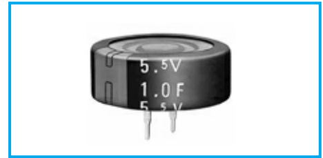
Marking color : White print on an indigo sleeve