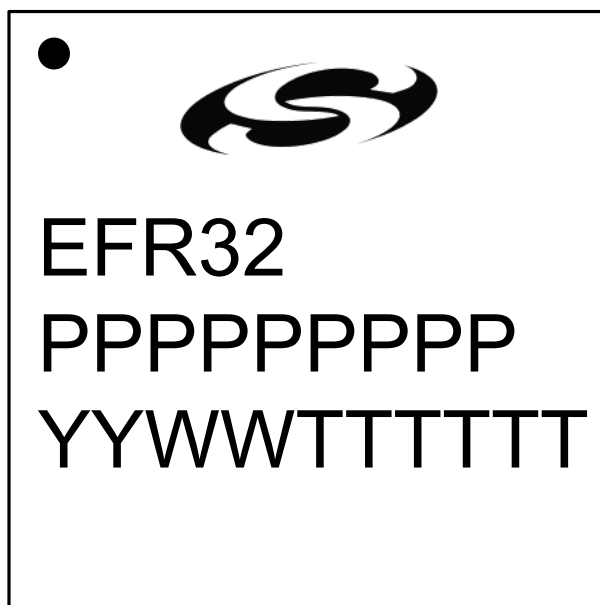
Figure 8.3. QFN32 Package Marking