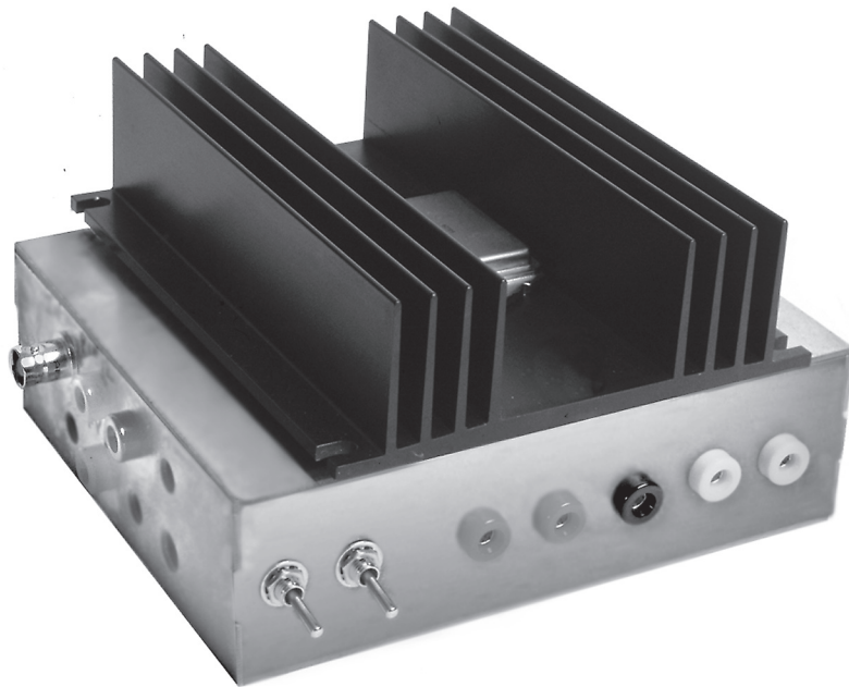
Figure 3: Inside of assembled box. Holes for components on long side were user drilled.