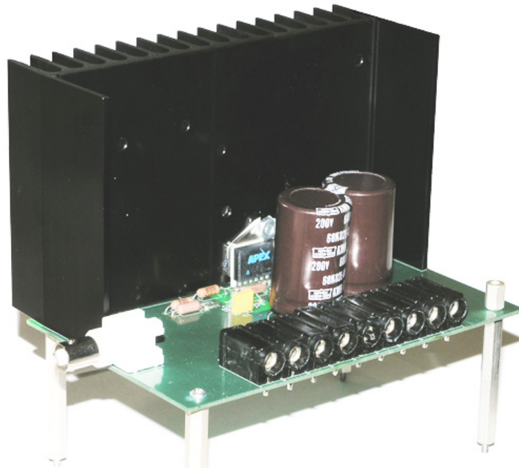
Figure 2: EK71 Assembly