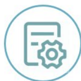
Boot Load Configuration