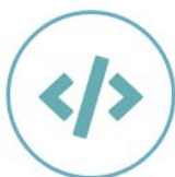
Code Storage & Execution (+XIP)