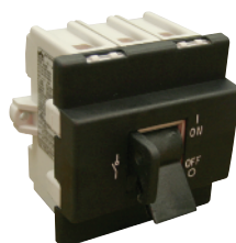
Special Black Toggle Handle Motor Disconnect Switch EVA3100 + K/EVAB