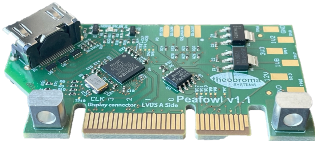
HDMI to CSI adapter ("Peafowl")

For the conversion of HDMI into CSI the adapter uses the Toshiba TC358749XBG HDMI bridge.