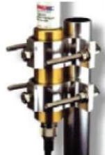
Figure 2: FM2 Mounting Kit (sold separately)