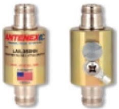
Figure 1: Lightning Arrestor LABH350NN (sold separately)