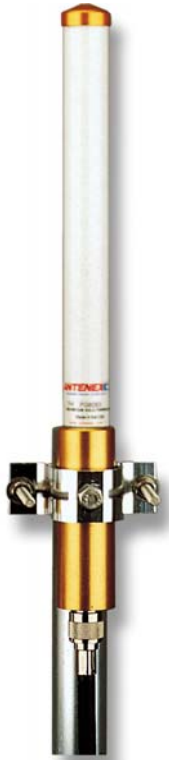
FG8960 (Shown with optional FM2SP mounting kit)