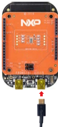
Figure 2: Connect kit to computer