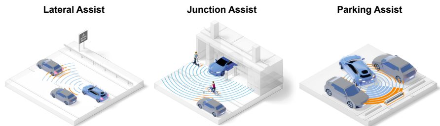
Figure 1: Target radar application