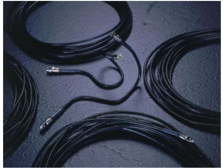
GORE™ RF Jumper Assemblies are available in a variety of lengths

The small bend radius makes these assemblies easier to route in tight spaces and a cable bend radius as small as 0.40 in (10.2 mm) is achieved with no degradation in electrical performance.