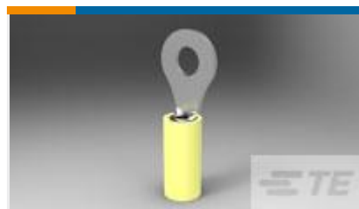
TE Part #2-323915-2 TERMINAL,PIDG R 26-22 6