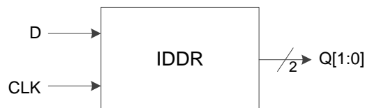
Figure 3-16 I/O Logic in DDR Input Mode

Figure 3-17 shows generic DDR output, with a speed ratio of PAD to FPGA internal logic 2:1.