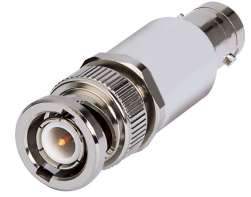
Generic photo used for illustration purposes only