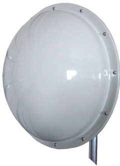
Dish antenna shown with optional radome