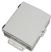
• DCE 7x6x2

The Die-Cast Enclosure (DCE) series offers a directional VPOL panel antenna that is contained within a die-cast aluminum enclosure. The enclosure adds to the long life of the antenna in outdoor environments. The powder coat paint over aluminum construction offers unsurpassed resistance to corrosion. The die-cast enclosure has extra heavy duty mounting flanges for reliable mounting to poles or surface mounting to walls along with the inclusion of seven engineered hole knockouts which allow for many different configurations of connectors and feedthrus without the need for drilling holes.