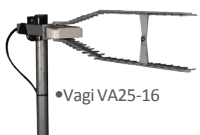
• Vagi VA25-16

The Vagi/Yagi Series are rugged, easy-to-install, high-gain directional antennas used in a wide variety of wireless systems where low cost, good performance and low wind loading are important factors. They include either a VPOL or HPOL configuration, along with a 1.5 VSWR as well. These antennas can be pole mounted in outdoor environments.