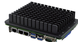
IB836 with Heatsink