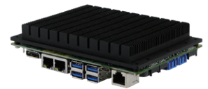
IB915 with Heatsink