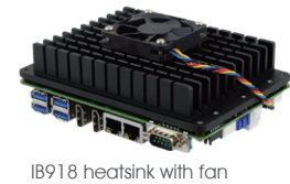
IB918 heatsink with fan