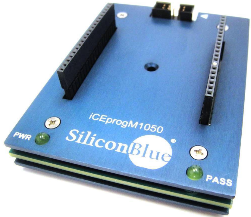
Figure 1: iCEprogM1050-01