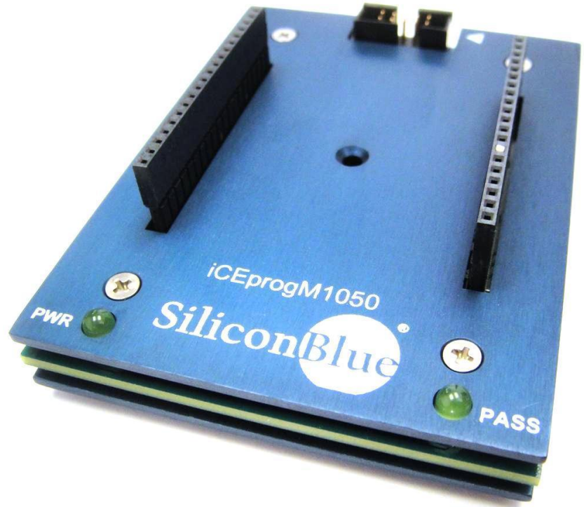
Figure 1: iCEprogM1050-01