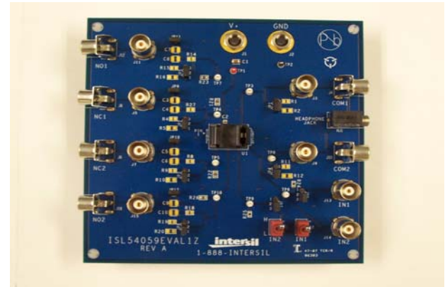
FIGURE 1. ISL54059EVAL1Z THROUGH ISL54064EVAL1Z EVALUATION BOARD