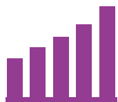
Scale + Supply 5-Yr Supply Warranty

Let us help you choose the right microphone for your project.