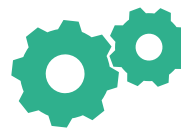
Technology Turnkey Provider