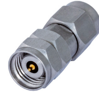
Generic photo used for illustration purposes only