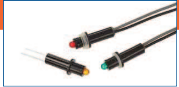
3mm Panel Mount LED Assemblies