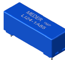
Marking according to EN60062/factory code gem. EN60062/Fertigungsstätte