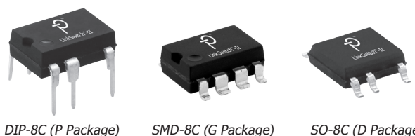
Figure 2. Package Options.