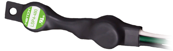
Field or Factory Installable