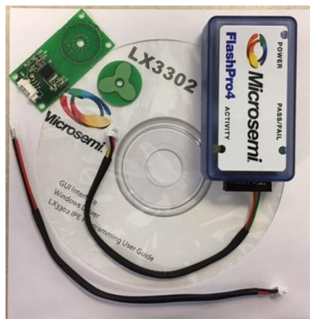
Figure one - LX3302A Evaluation Kit