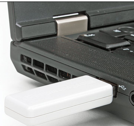
Figure 1-3: USB Dongle plugged into Laptop USB host connector

Unfortunately not. If you lose your dongle you will need to buy a new compiler license and pay the full price.