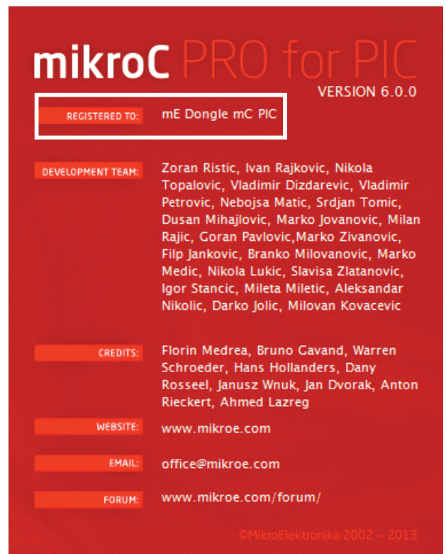
Figure 1-2: mikroC PRO for PIC® About Window