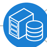
Asset Management Platform