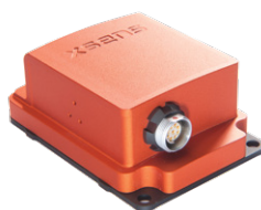
MTi encased: 57x42x23.5 mm, 52g, 9-pins push-pull connector