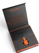
MTi 100-series Development Kit: MTi, software and cabling