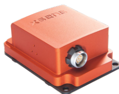
MTi encased: 57x42x23.5 mm, 52g, 9-pins push-pull connector