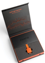
MTi 100-series Development Kit: MTi, software and cabling