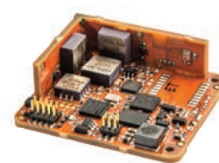
MTi-G-710 OEM: 37x33x12 mm, 11g, 16-pins header