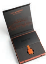
MTi-G-710 Development Kit: MTi-G-710, antenna, software and cabling