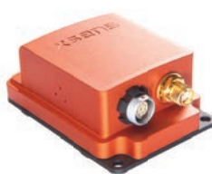
MTi-G-710 encased: 57x42x23.5 mm, 55g, 9-pins push-pull connector