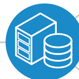
Asset Management Platform