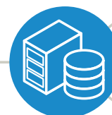
Asset Management Platform