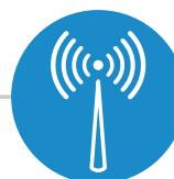
Wireless Service Provider