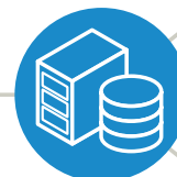
Asset Management Platform