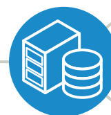
Asset Management Platform