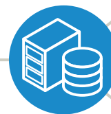
Asset Management Platform