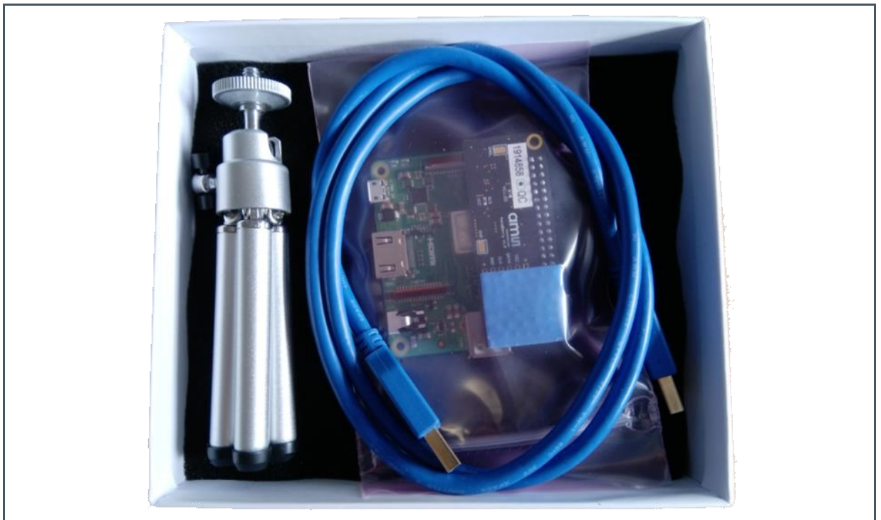
Figure 1: Eval Kit Content