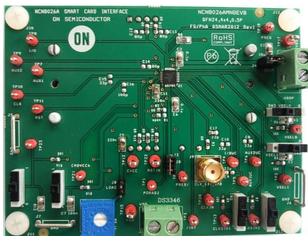
Figure 1. Evaluation Board

This document has to be used with the NCN8026A datasheet. The datasheet contains full technical details regarding the NCN8026A specifications and operation. The board (FR4 material) is implemented in two metal layers. The top and bottom layers have thicknesses of 35 µm. The PCB thickness is 1.6 mm with dimensions of 89 mm by 68 mm (see Figure 1).