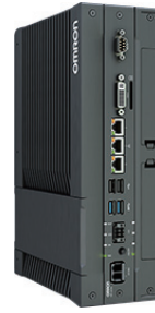
NYB1E, NYB17, NYB25, NYB1C

Our NY industrial Box PC has been designed from first principles to be powerful, reliable and scalable, making it ideally suited to visualization, data handling, measuring and controlling. The latest insights in design simplification eliminates faults caused by complexity which, with other unique design features, maximizes uptime and reduces costs. The future will be IT driven: Omron's Industrial PC platform will make you part of it.