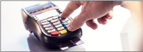
Point of Sale (POS)