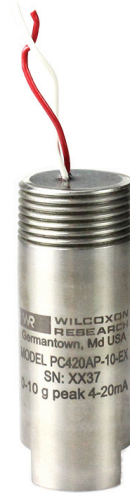
Table 1: PC420Ax-yy-EX model selection guide