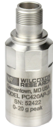
Table 1: PC420Ax-yy model selection guide

Wilcoxon's PC420A series sensors provide a 4-20 mA output proportional to vibration, allowing for continuous trending of overall machine vibration. This trend data alerts users to changing machine conditions and helps guide maintenance in prioritizing the need for service. The choice of RMS or peak output allows you to choose the sensor that best fits your requirements.