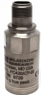
Table 1: PC420ATP-yy model selection guide

Wilcoxon's PC420ATP series sensors provide 24/7 output of true peak acceleration, allowing for continuous trending of overall machine vibration in process control systems. True peak output is particularly useful in detecting loose parts on reciprocating machinery. The trend data alerts users to changing machine conditions and helps guide maintenance in prioritizing the need for service.