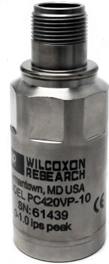
Table 1: PC420Vx-yy model selection guide

Wilcoxon's PC420V series sensors provide a 4-20 mA output proportional to velocity vibration, allowing for continuous trending of overall machine vibration. This trend data alerts users to changing machine conditions and helps guide maintenance in prioritizing the need for service. The choice of RMS or peak output allows you to choose the sensor that best fits your requirements.