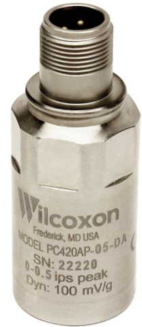
Table 1: PC420Ax-yy-DA dual output model selection guide

Wilcoxon's 4-20 mA vibration sensors integrate easily with an existing PLC, DCS or SCADA system. The PC420A-DA series dual output sensors provide 24/7 monitoring of overall machine vibration for continuous trending, alerting users to changing machine conditions and helping to guide maintenance in prioritizing the need for service. The choice of true RMS, true peak or peak output allows you to choose the sensor that best fits your industrial requirements. The sensor's 4-20 mA output is proportional to acceleration vibration. The dynamic output signal is derived from an internal buffered amplifier and requires that the 4-20 mA loop be powered.